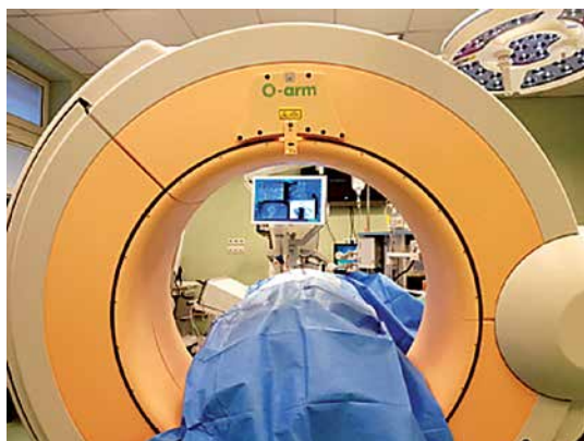
Figure 1. Operating theatre, O-arm (Medtronic PLC, Littleton, Massachusetts, USA) integrated with Stealth Station Navigation System (Medtronic PLC, Louisville, Colorado, USA)