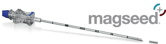
Figure 2. Sterile introducer and Magseed

Apart from standard markers in breast cancer surgery (such as wire localisation or metal clips), magnetic markers present a promising new option for breast tumour localisation. A literature search revealed that published data on the topic are highly insufficient, and so the aim of the present paper is to offer an up-to-date review focused on magnetic marker localisation in breast cancer surgery.