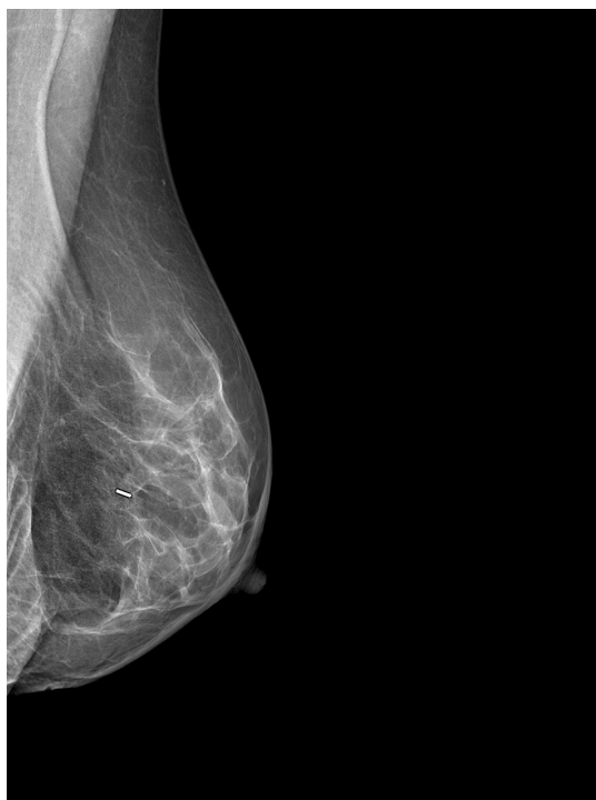
Figure 3. Mammogram with Magseed implementation at the site of the breast tumour (University Hospital Ostrava)

tected by a handheld magnetometer, SentiMag (Endomagnetics, Inc.) (Figure 4) at a distance up to 30 mm away [17, 18]. If the Magseed is placed deeper than 30 mm, it may not be detectable, but using palpation with a probe, which means tissue compression, deeper Magseeds are possible to detect. The Magseed may be implanted safely up to 30 days before surgery, but ongoing clinical trials are currently investigating a longer implantation