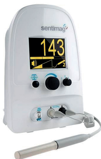
Figure 4. Handheld SentiMag magnetometer