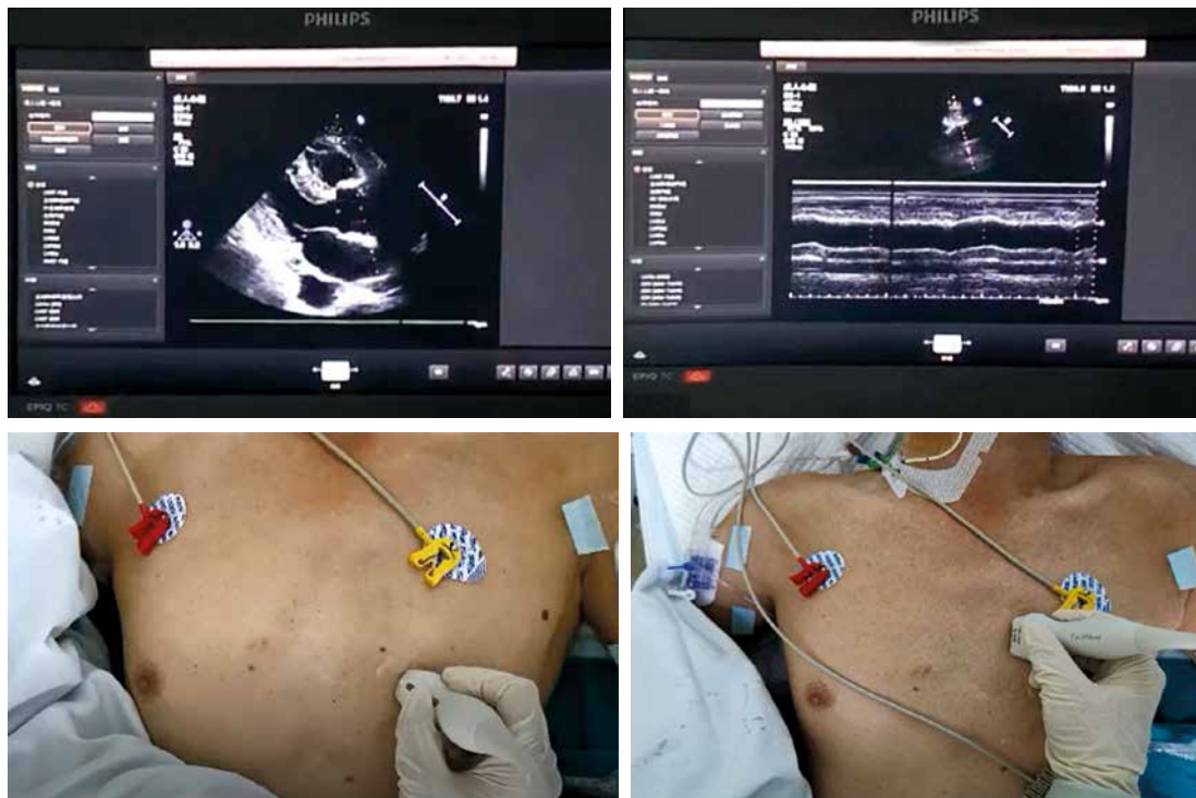
Figure 2. The probe position and measurement of SVC by TTE. The parasternal long-axis view was obtained at the left parasternal between the third and fourth intercostal spaces with the probe marker pointing toward the patient's right shoulder. The probe position was then adjusted to image the longitudinal axis view of the SVC parallel to the aorta at the left parasternal between the second and fourth intercostal spaces by pointing the probe marker cephalad and tilting the appropriate angle medially from the sagittal to the coronal plane

collapse during the respiratory cycle reflects insufficient venous filling and can be tackled by volume expansion [10]. Subsequently, they verified that an SVCCI \geq 36\% obtained by TEE was evidenced as a robust index of fluid responsiveness in mechanically ventilated patients with 90% sensitivity and 100% specificity [11]. In a large cohort, Vignon et al. reported that the AUC for SVCCI (0.75) was significantly greater than the distensibility index of IVC (0.63) in patients with mechanical ventilation [12]. The cut-off value for SVCCI was 21% (61% sensitivity, 84% specificity), which is consistent with ours. The reason for the better predictive value of SVCCI is still far from being elucidated. A plausible explanation is the greater extent of intrathoracic pressure change than the intra-abdominal pressure caused by mechanical ventilation, which contributes to more evident fluctuation in venous return of SVC. 2) Compared with IVC, SVC is located entirely in the thoracic cavity, so it could hardly be affected by intra-abdominal pressure [3, 13]. Several lines of evidence have suggested that the intraabdominal pressure has a remarkable effect on the IVC variation, which is independent of fluid responsiveness [1, 14]. 3) The application of abdominal bands, gauze, and adhesive tape on the midline incisional site after open surgery restricts the acquisition of IVC in the subxiphoid area. SVC vari-