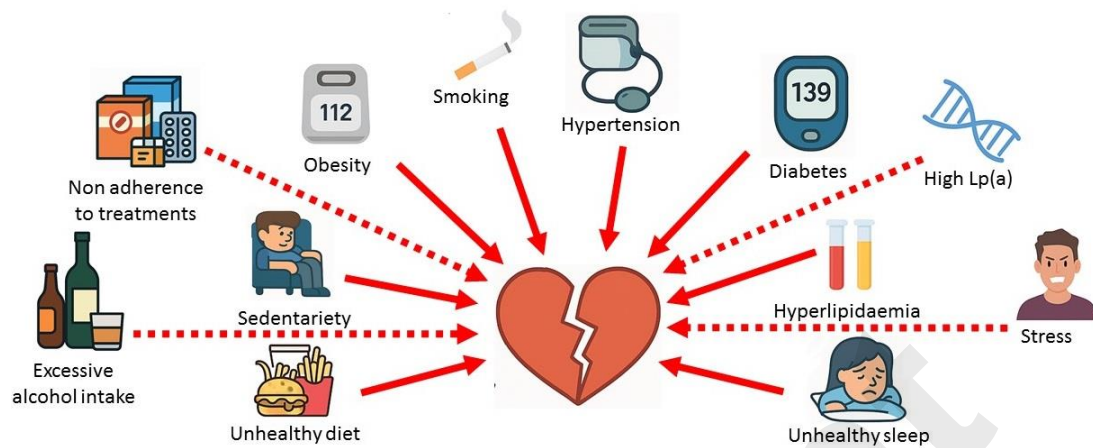
Figure 1. The interplay of different modifiable risk factors with cardiovascular health in relation to the ILEP-SMILE approach.