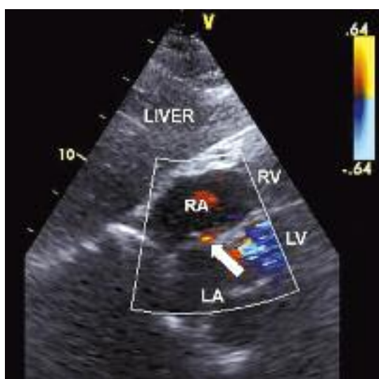
Figure 3. Transthoracic two-dimensional echocardiography. Subcostal view with colour Doppler flow mapping indicates presence of small left-to-right shunt through patent foramen ovale LA – left atrium, RA – right atrium, LV – left ventricle, RV – right ventricle

LV volume overload and pulmonary hypertension were not observed. Q_p : Q_s index was 1.3. No other lesions associated with PDA were observed. Only LA diameter was enlarged (45 mm). The small PFO seemed to be of no haemodynamic significance either. Presumably, due to the exacerbation of depressive syndrome, the patient did not give her consent to further diagnostic procedures and possible interventional occlusion. For that reason no further examinations were performed. The lack of haemodynamic significance of PDA and PFO justified the chosen course of treatment. The patient was treated with vitamin K antagonist (VKA) (recommended INR value was achieved) and infectious endocarditis prophylaxis was applied. The general condition of the patient improved, and no episodes of paroxysmal atrial fibrillation occurred. Discharge recommendations included VKA