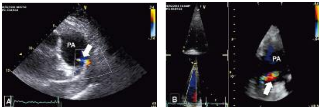
Figure 1. Transthoracic two-dimensional echocardiography (panel A) and three-dimensional echocardiography (panel B). Modified parasternal view with colour Doppler flow mapping reveals presence of turbulent flow (arrow) in dilated pulmonary artery (PA) indicative of left-to-right shunt through patent ductus arteriosus

According to current ESC and ACC/AHA recommendations [7, 9] PDA is regarded as significant when the following are found: LV and/or LA dilatation, LV volume overload, pulmonary hypertension and associated lesions which may occur in PDA. Although the PDA had excessive diameter (ca. 8 mm), there was no evidence of clinical or haemodynamic significance. The LV dilatation,