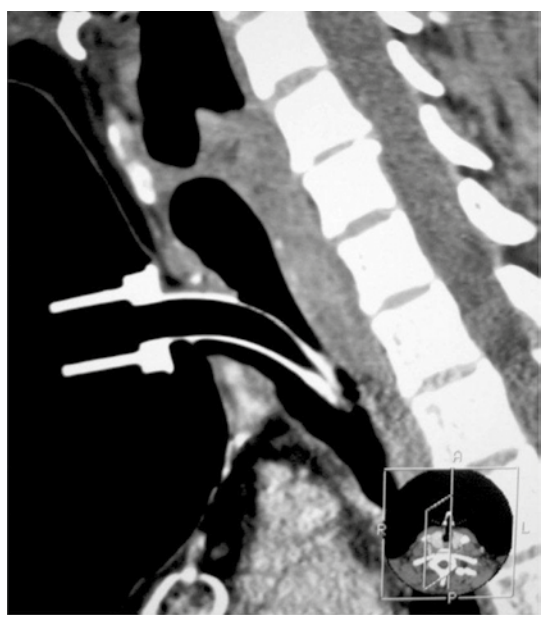
Figure 3. Laryngostenosis in patient with laryngeal tuberculosis. Tracheostomy

Moreover, histopathological examination revealed in 5 cases coexistence of planoepithelial carcinoma with tuberculosis. In all 5 cases total laryngectomy was performed. Chest X-ray was performed in all patients and the evidence of lung tuberculosis was confirmed in 14 (70%) cases. Tuberculin skin test was positive in 10 (66.6%) out