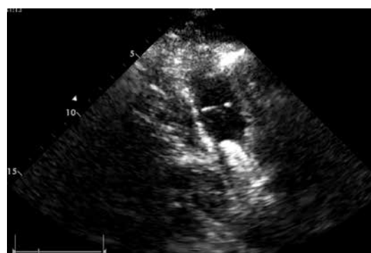
Figure 2. TTE view of our 4 th patient showing migration of the Amplatzer occluder device into the main pulmonary artery 24 h after its deployment