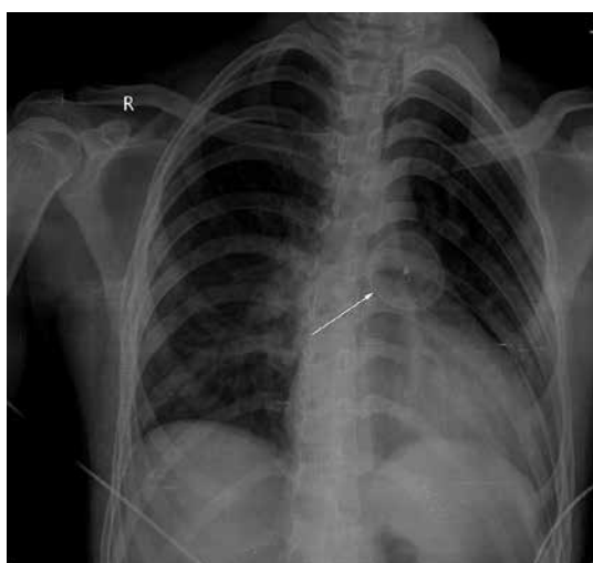
Figure 1. Chest X-ray view of our 3 rd patient showing the embolized device in the pulmonary conus

of our institution, whereas the remaining patient underwent this procedure in another institution. All of these patients were referred to our clinic for emergency surgery. Mean age was 25.5 years (15–45) and 3 of the patients were female (50%). Timing of the emergency operation was planned after the diagnosis of the migration of the occluder in 10 min to 2 weeks after the intervention. The demographic data and the device characteristics are summarized in Table I (The 5 th patient was referred from another institution. Therefore, the sizing measurements were not available.) The diagnosis was made via transthoracic echocardiography (TTE) preoperatively. The migration of the device was noticed during fluoroscopy in the 10 th min after the deployment in the 1 st case. In the 3 rd case, this displacement was detected at control chest X-ray in the 48 th h after the deployment (Figures 1 and 2). In the 1 st case, the operating team of the Cardiology Department tried to remove the embolized device from the right ventricle with biopsy forceps; but this attempt was unsuccessful. The remaining 5 patients were directly referred to our clinic for surgery. All 6 patients underwent emergency operations. The operation technique was standard with inclusion of pulmonary arteriotomy in cases of migration to the pulmonary artery. After median sternotomy, the pericardium was incised vertically. Following the standard bi-