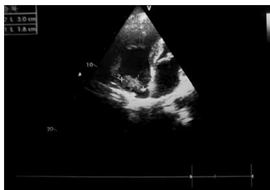
Figure 5. TTE view of one of our patients showing hypoechoic mobile mass lesion of 30 mm × 16 mm inside the right atrium consistent with thrombus material and successful closure of ASD

Embolization of the device remains one of the possible complications. Devices usually embolize into the main pulmonary artery [1]. This rate of embolization was 89% in the study of Chessa et al. and they embolized within 24 h. In our series the rate of embolization in the main pulmonary artery is 67% (4 cases). Again in our series, embo-