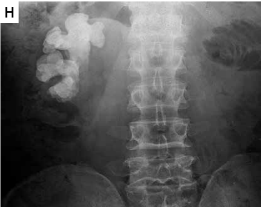
Figure 1. Cont. G – During the surgery of such patients, a handful of operation channels may be simultaneously established in different calyces under ultrasonic guidance; H – Preoperative kidney, ureter and bladder (KUB) showed staghorn stones. High density areas were observed all over the renal pelvis, located between the first and the third lumbar vertebrae, about 8 cm × 4 cm. Stones were seen in the entire right pelvis, from upper, median to lower kidney; I – KUB after the operation: lithotripsy was done through a single channel penetrating the median calyces with favorable outcomes

Table I. Univariate analysis of the potential factors for severe postoperative bleeding