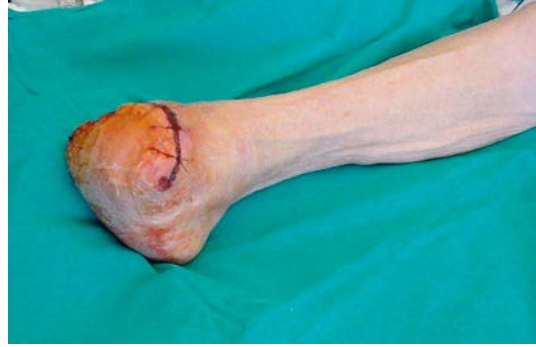
Figure 2. Patient 12 weeks after therapy and minor amputation

study (after 3 months), the index increased significantly ( p < 0.00222 , Wilcoxon test) to 0.52 \pm 0.52 . In 4 cases there was no chance to complete the ABI examination due to lower limb amputation. No improvement in ABI was observed in these patients at 1 month after starting treatment. There was no improvement in the ABI in group 2.