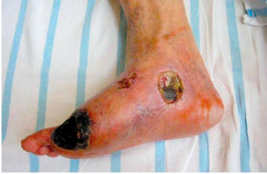
Figure 1. Patient before therapy