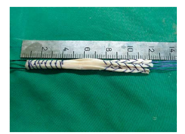
Figure 1. The single bundle four-strand graft was about 12 cm long. The four ends of the four-strand tendon were sutured with '2' polyester whip-stitch-style sutures separately. Its diameter was 8–9 mm

The purpose of our studies was to compare the outcomes of PCL reconstruction using autografts and allografts retrospectively. Our hypothesis was that the clinical results of PCL reconstruction using allografts were equivalent to those using autografts.