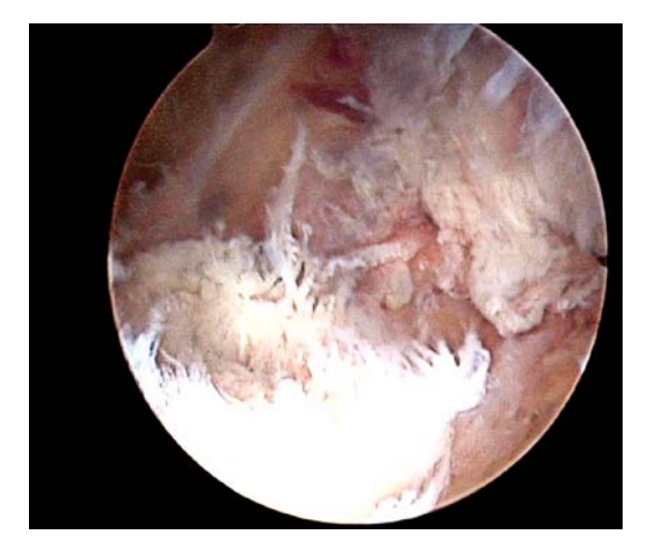
Figure 2. The torn post cruciate ligament was found through the posteromedial portal. The ligament was torn completely. The PCL remnant was observed. In the operation process, the remnant was conserved

SPSS 13.0 was used for statistical analysis. The independent-samples and paired-samples T -tests