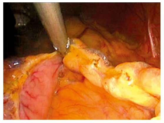
Figure 1. Division of the vascular supply of the greater curvature of the stomach

allowed determination of absolute counts. Evaluation of CD4 and CD8 lymphocytes was performed by three-color immunofluorescence flow cytometry using a monoclonal antibody (MAb) panel for the desired cell surface proteins including fluorescein isothiocyanate (FITC) or phycoerythrin (PE)-conjugated MAb to CD4 and CD8 (Beckman Coulter Electronics, Hialeah, FL). All antibodies were prepared according to the manufacturer's directions and then were incubated with whole blood for 5 min at 25°C before red cell lysis and fixation using Immunoprep reagents and Q-prep equipment (Beckman Coulter), as directed by the