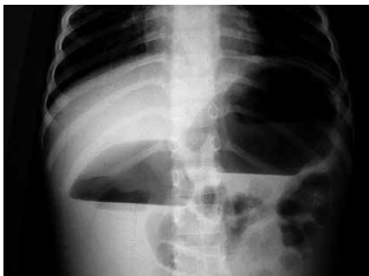
Figure 4. An upright abdominal X-ray showing marked dilatation of duodenum

men between the 8 th and 10 th weeks of gestation [3, 12].