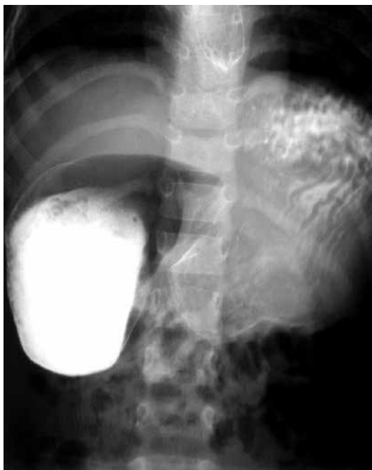
Figure 5. Barium meal showing esophageal stricture, hugely distended duodenum and the mucosal lining of the web

Duodenal web in association with obstruction due to foreign bodies is rare. In the series of Nawaz et al. [15], they presented 22 children with congenital duodenal obstruction. Eight children had duodenal web. Five patients were found to have duodenal diaphragm with a central hole, while the others had complete duodenal diaphragms. Additionally, they reported a case of duodenal obstruction secondary to a duodenal diaphragm with a central hole that was obstructed by date seeds. In contrast to this, Bhat reported a 6-year-old male who presented with an acute duodenal obstruction precipitated by multiple pigmented stones completely blocking the duodenum. In their case, more than 50 small, black stones impacted the small aperture of the web, causing obstruction [14].