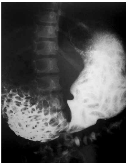
Figure 2. Barium meal shows dilated duodenum proximal to the web and multiple filling defects

M – male, F – female, GER – gastroesophageal reflux, ASD – atrial septal defect, GD – gastric dilatation, DB – double bubble.