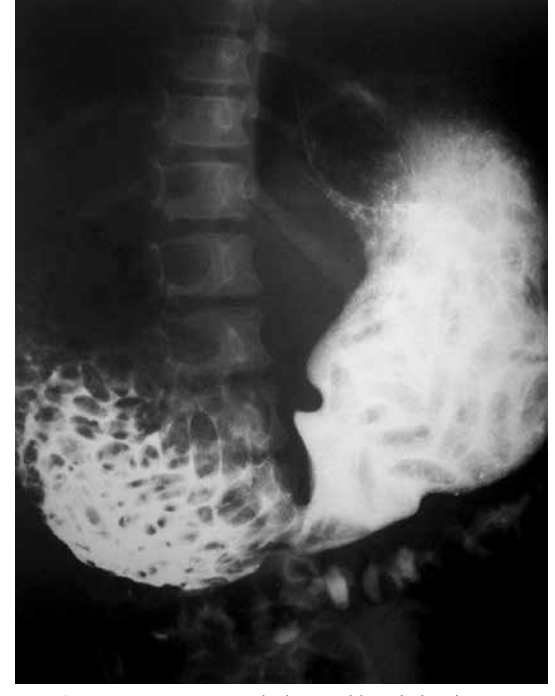
Figure 2. Barium meal shows dilated duodenum proximal to the web and multiple filling defects

M – male, F – female, GER – gastroesophageal reflux, ASD – atrial septal defect, GD – gastric dilatation, DB – double bubble.