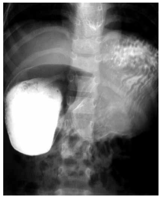
Figure 5. Barium meal showing esophageal stricture, hugely distended duodenum and the mucosal lining of the web

Duodenal web in association with obstruction due to foreign bodies is rare. In the series of Nawaz et al. [15], they presented 22 children with congenital duodenal obstruction. Eight children had duodenal web. Five patients were found to have duodenal diaphragm with a central hole, while the others had complete duodenal diaphragms. Additionally, they reported a case of duodenal obstruction secondary to a duodenal diaphragm with a central hole that was obstructed by date seeds. In contrast to this, Bhat reported a 6-year-old male who presented with an acute duodenal obstruction precipitated by multiple pigmented stones completely blocking the duodenum. In their case, more than 50 small, black stones impacted the small aperture of the web, causing obstruction [14].