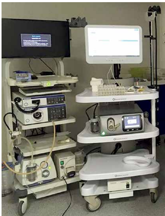
Figure 2. Olympus Evis Exera III tower (left) and FUSE tower (right)

was performed by one of three experienced endoscopists (each of whom had performed more than 5000 colonoscopies). A standard, commercially available, high-definition colonoscope (190 series Exera III NBI system with DF capability) was used for all SFV colonoscopies in this study.