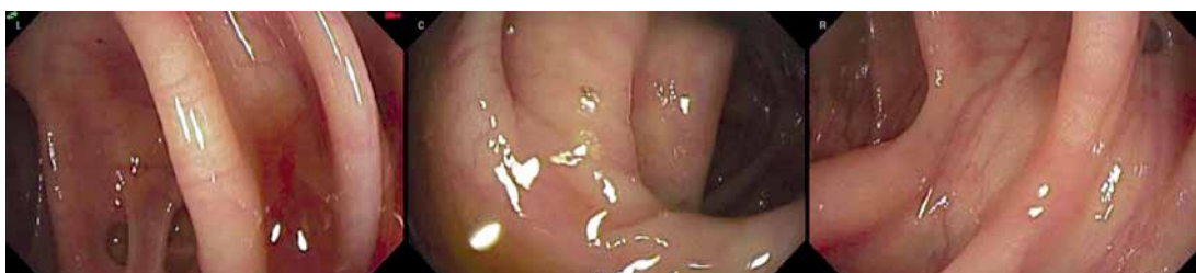
Figure 3. FUSE endoscopy display. The full-spectrum endoscopy (FUSE) helps to visualise the proximal sides of the haustral folds

In total 209 patients were examined with SFV and 199 with FUSE endoscopes. The mean age of patients was 64.3 \pm 11.67 years. Both groups were comparable in terms of sex ( p = 0.412 ), age, and BMI ( p = 0.198 ) and the preparation of individual colonic regions. Patient characteristics are presented in Table I. All patients completed the study, and the success rates of caecal intubation were 100% with the SFV and FUSE colonoscopes. The CIT was significantly longer in the FUSE than in the SFV group ( p < 0.001 ) (Tables II and III). With-